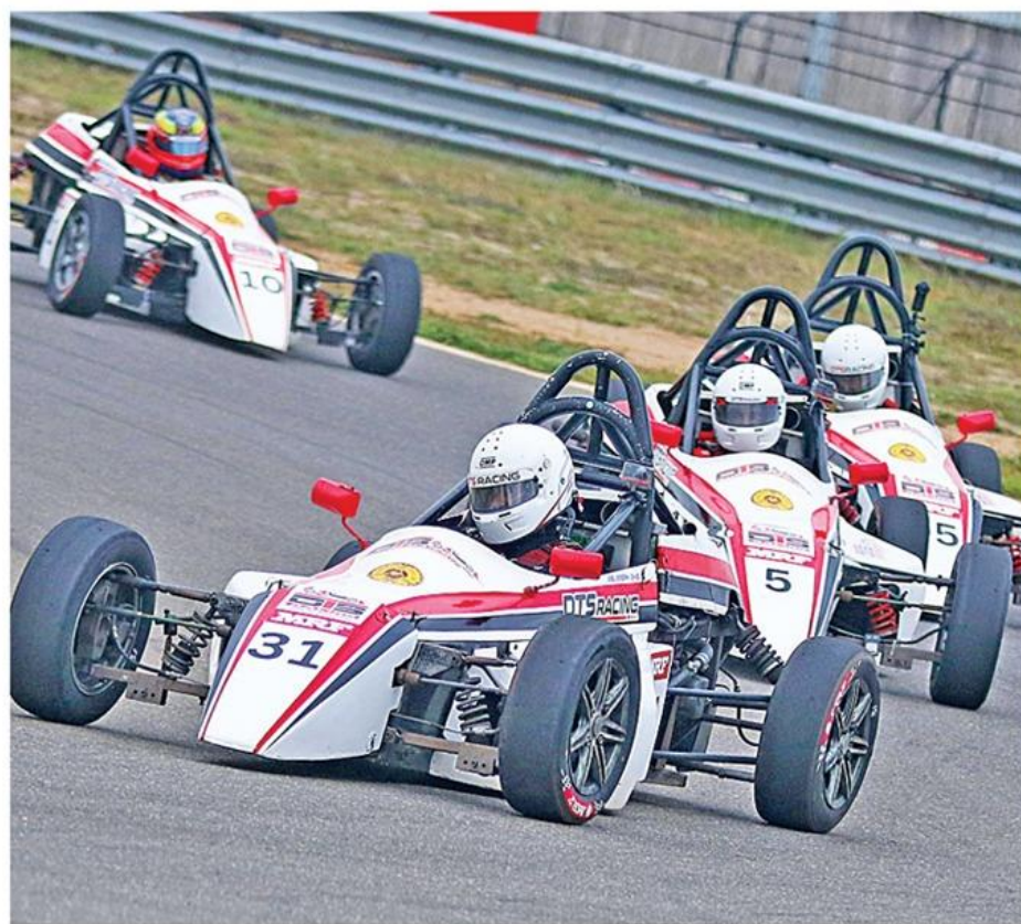
Action during the Formula LGB 1300 race in the MMSC FMSCI Indian National Car Racing Championship.