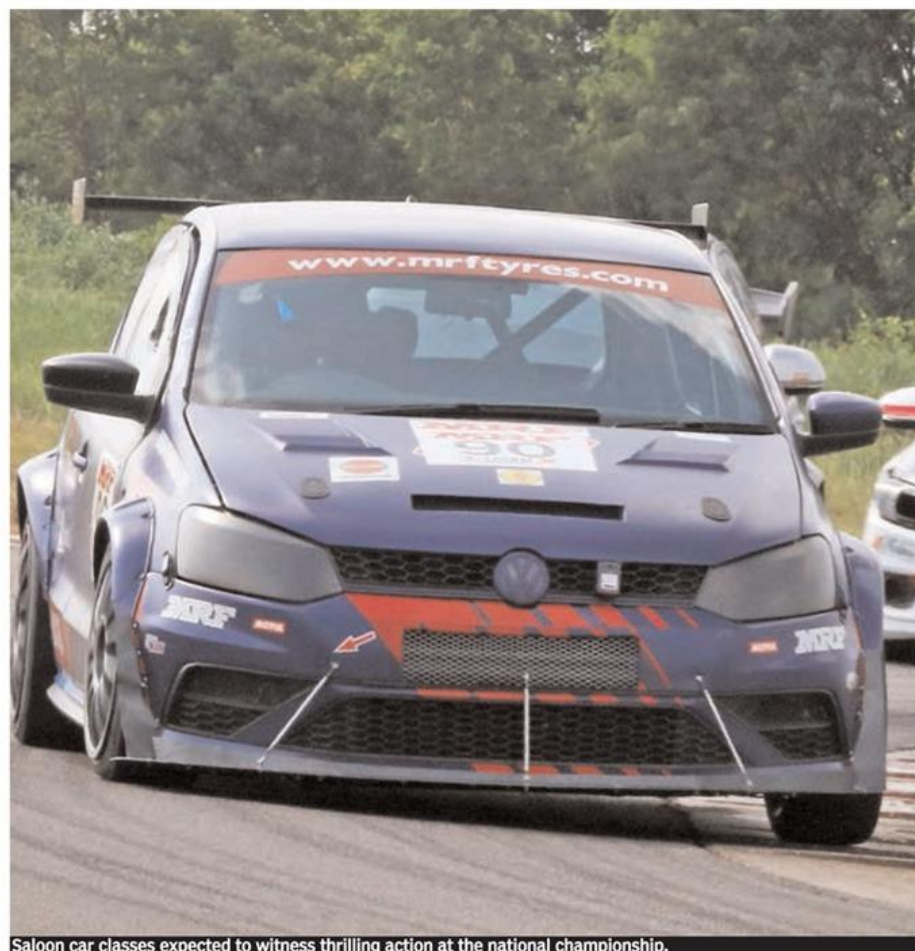
Saloon car classes expected to witness thrilling action at the national championship.

The Formula LGB 1300 category which has never failed to dish out exciting and entertaining races,